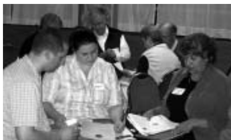
Participants discuss the issues

"This was an excellent balanced Catholic presentation."