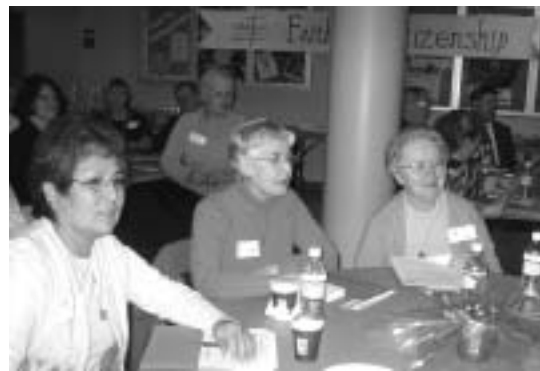
2004 Advocacy Day in Olympia