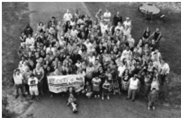
Nearly 400 people gathered for the Western States Center's 2005 "Community Strategic Training Initiative" in Oregon. At this annual three-day gathering, community activists from all over the Northwest learn how to become more effective social changers.