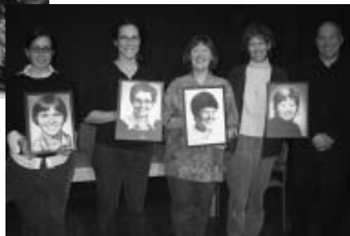
Cast of Same Fate as the Poor